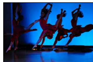
The Varsity Dance Team performs "One Moment More"