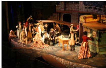
The cast performing the second act opening song, "God, That's Good!"

So congratulations to everyone involved - this is one show we'll remember for a long, long time.