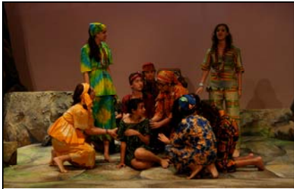
The Broadway Bound class rehearses one of many ensemble scenes in Once on This Island, Jr.

Once on This Island originated at Playwrights Horizons in New York City during the 1989-1990 workshop season. After enjoying rave reviews and sold out audiences Off-Broadway, Once on This Island opened at the Booth Theater on Broadway on October 18, 1990 and played for 469 performances and 19 pre-views. The show received eight Tony Award nominations, including Best Musical, Best Score and Best Book. On May 12, 2002, the original Broadway cast reunited for a special two night concert performance benefiting Broadway Cares/Equity Fights AIDS and the Cantor Fitzgerald Relief Fund.